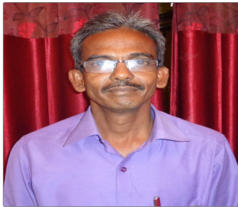
Evangelist Aju Varghese